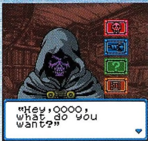
THE MASTER'S HOUSE SCREEN

You, who have dared to venture into the gloomy world of The Dark Realm, must work from The Master's House wherein The Master resides, and conquer the 4 areas of this region to obtain powerful Arm weapons. In The Master's House, you can also change and raise Arms as well as save game data.